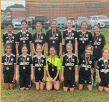
2009 Girls Third Place

Congratulations to our Legacy Girls teams on their participation in the Marlboro Kick-Off Classic!