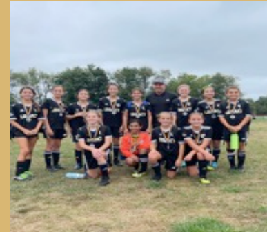
2010 Girls Finalists